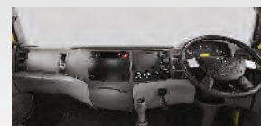
Cabin World class Prima LX cabin with best-in-class driving comfort