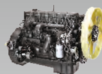
Engine High performance 267 HP CRDi engine by Cummins