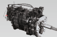
Gearbox Proven Tata G1150 9-speed gearbox